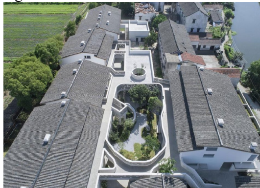
Figure 1 Kunshan Jijiadun homestay